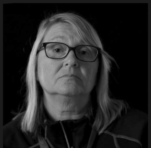
Nurses talk truth.